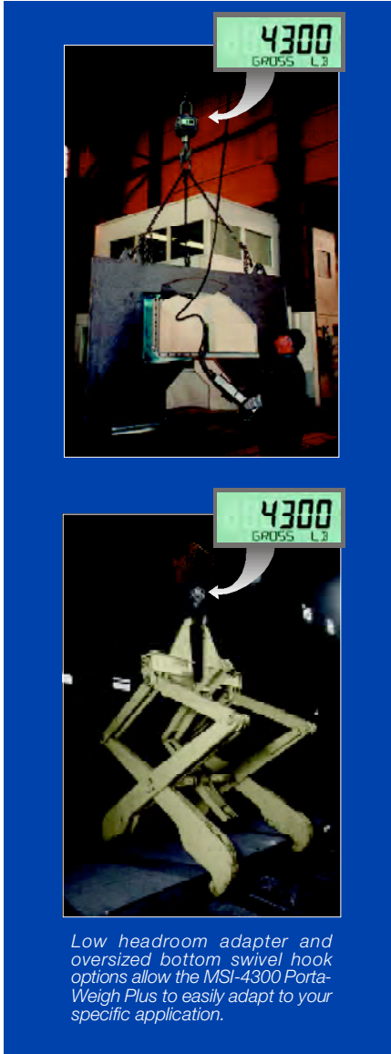
Low headroom adapter and oversized bottom swivel hook options allow the MSI-4300 Porta-Weigh Plus to easily adapt to your specific application.