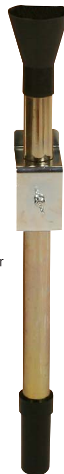
P/N 950054 Probe Container Kit with Wall Mount Bracket

P/N 950050 Kit of probes includes: • P/N 24304 Flexible Probe • P/N 24305 Metal Probe • P/N 24316 Flexible Probe • P/N 24306 Metal Probe • P/N 24307 Flexible Probe • P/N 24308 Flexible Probe