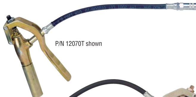
P/N 12070T shown

Same as 12070T above, but includes P/N 12003T 'Z' swivel.