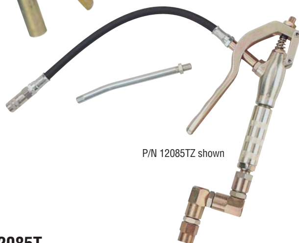
P/N 12085TZ shown

Booster grease control valve allows discharge pressure to be built up to 14,000 PSI by squeezing control handle. Includes manual relief valve to relieve pressure for easy disconnection from grease zert.