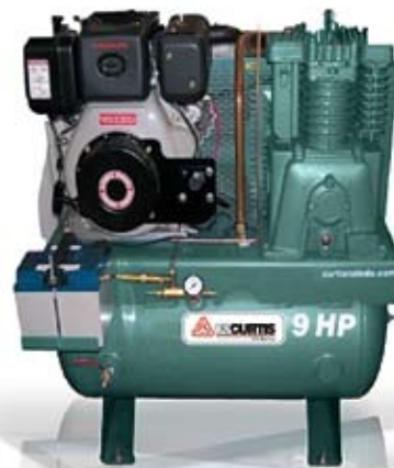
9E2GT3-YB 9HP tank mounted Yanmar diesel driven