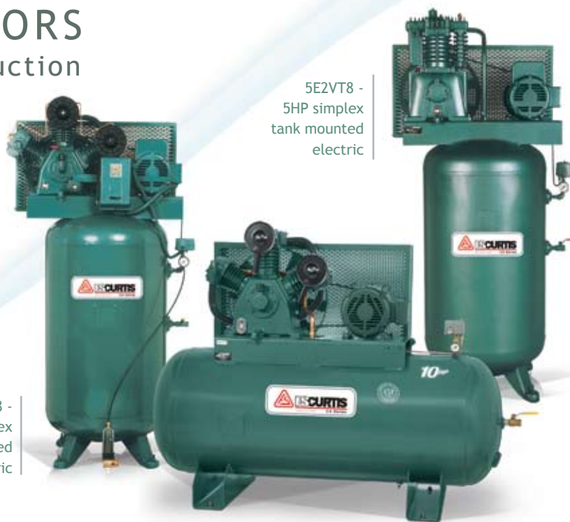
5E2VT8 - 5HP simplex tank mounted electric