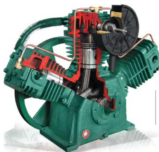
Cutaway Illustration for model E-50 Basic Pump

Quality and industrial durability are built into each cast iron pump to give you a solid return on your compressor investment. Engineered to last - heavy cast iron construction. Serious protection - comes standard with ductile iron crankshafts, high strength metal connecting rods, rod insert bearings, wrist pin bushings, high-capacity hardened and lapped stainless steel valves with suction valve head unloaders. Efficiency - maximum CFM output per energy dollar.