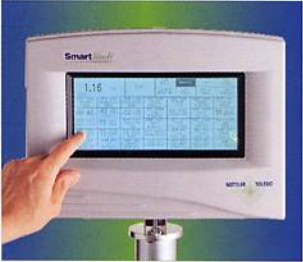
8361 SmartTouch Controller

8450 Client Scale can network to "Master" Mettler Toledo scale/controllers or to ISP.