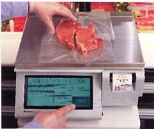
8461 SmartTouch Integrated Scale/Printer

8450 Client Scale can network to "Master" Mettler Toledo scale/controllers or to ISP.